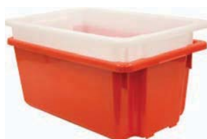
SNR002NAT / SNR002RED 52L