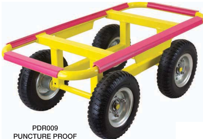
PDR009 PUNCTURE PROOF