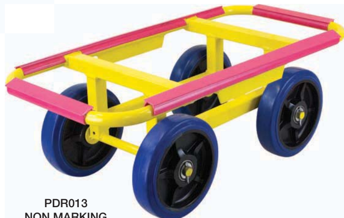
PDR013 NON MARKING